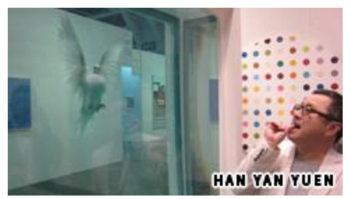
The Inescapable Truth, Damien Hirst.